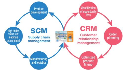
The LAWSON SCM-CRM Model facilitates development of delicious, highly appealing products and product offerings from the customer's perspective. It uses Ponta Point Card members' personal attributes (gender, age, region of residence, etc.) to analyze their purchasing behavior, visualize expected opportunity loss (missed sales) and conduct order planning. This analysis also contributes to food waste reduction. CRM activities provide the driving force for increasing sales and profitability by helping us to understand our communities, stores and customers better.